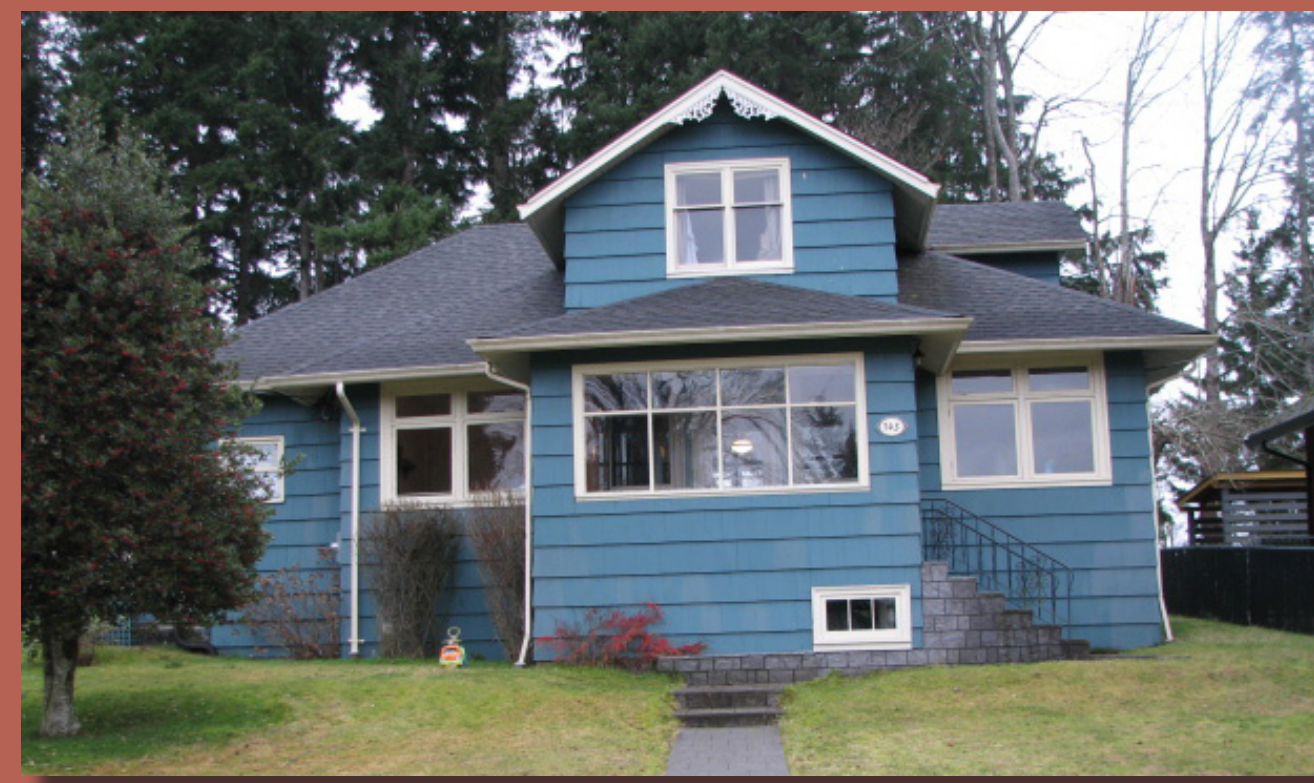
145 Douglas Place