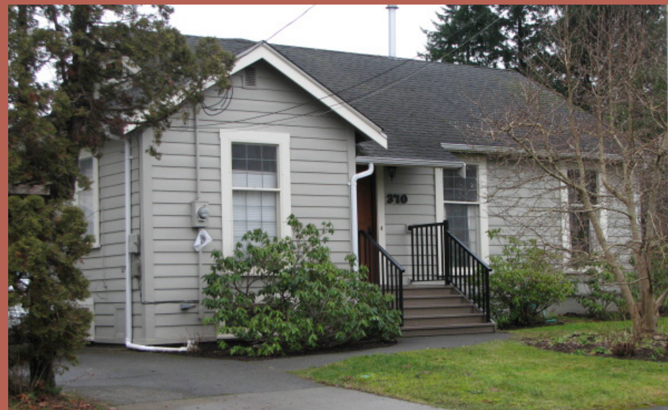
370 1st Street