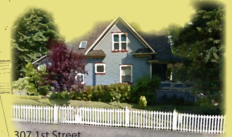
307 1st Street