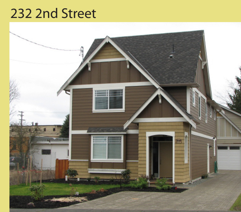
232 2nd Street