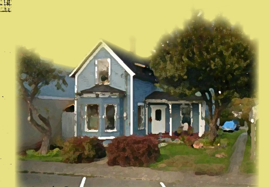
443 4th Street

The Billy Booth House (top) and the Creech House (bottom) are 2 of 21 properties in the City of Courtenay Heritage Register.