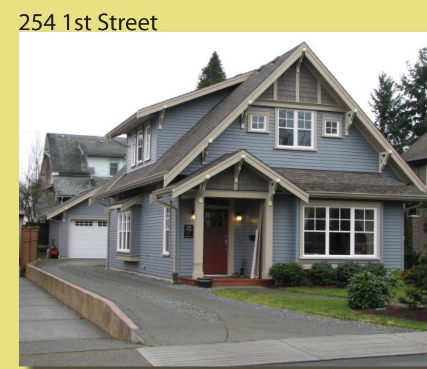
254 1st Street

The Billy Booth House (top) and the Creech House (bottom) are 2 of 21 properties in the City of Courtenay Heritage Register.