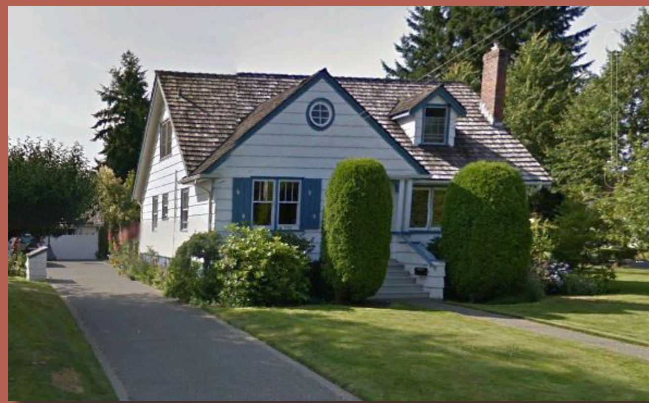
290 1st Street