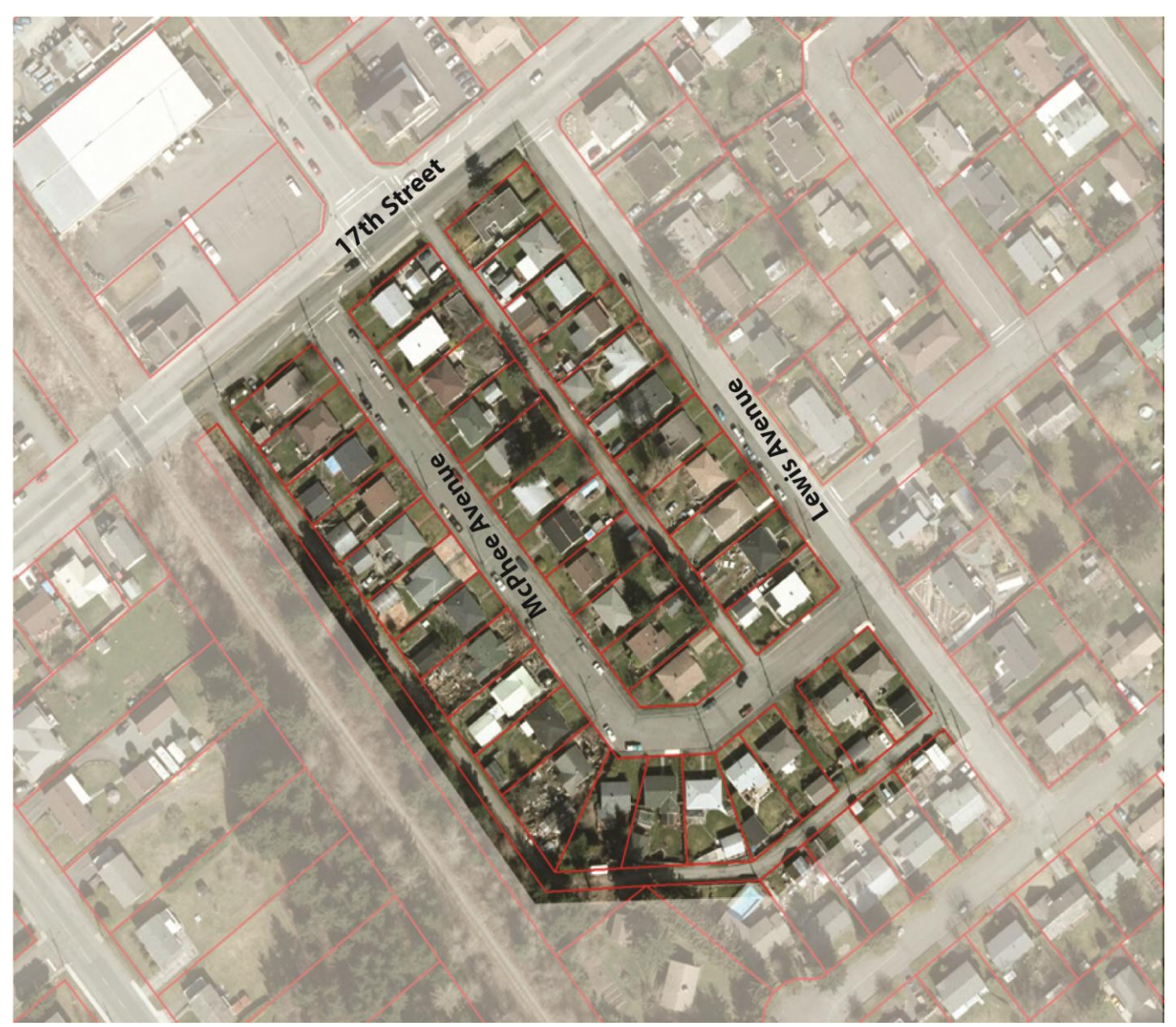
The 40 houses neighbourhood shown in an aerial photograph taken in 2012. Lot lines are shown in red.