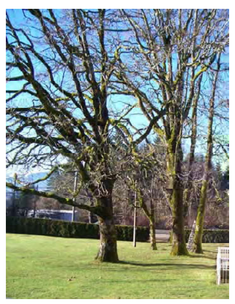
Garry Oaks at St. Andrews Presbyterian Church

The Tsolum River Valley Garry Oak Ecosystem is a unique ecosystem in north Courtenay roughly located between Headquarters Road, Highway 19a, Vanier Drive and Ryan Road, and include prominent sites such as the Glacier View/Dingwall neighbourhood, Comox Valley Sports Centre property, the Vanier School property, the forest north of Vanier school, and the Presbyterian and Anglican church properties on Highway 19a. The area is approximately 115 acres in size and features over one hundred Garry oak trees as well as numerous species of mature trees and vegetation.