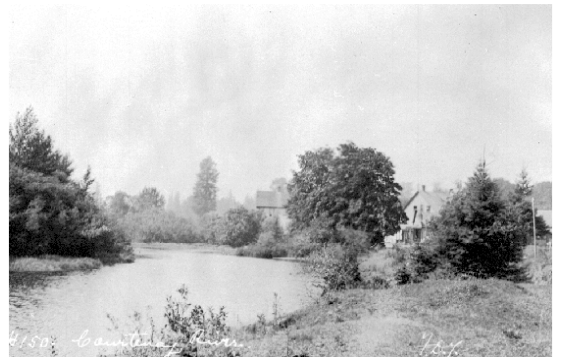
Courtenay River, 1911, BCAR-B-01882

Courtenay River and Estuary. The remnants of these aboriginal fish traps are valued as a unique educational opportunity to study sustainable First Nations fishing technologies and culture for all citizens.