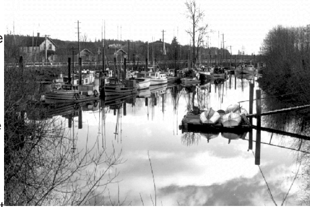
Fishing Boats in the Slough, 1946.

Simms Millennium Park has an historical relationship with two noteworthy businesses that occupied the site. including Simms Wharf, and Brackman and Kerr Milling Company which operated on the site from 1917 to 1958. Both businesses were situated facing the Courtenay River, highlighting the importance of the river as a transportation corridor for Courtenay's economy.