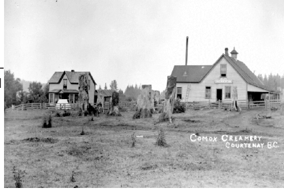
Comox Creamery Building, c. 1905 BCAR-H-00910